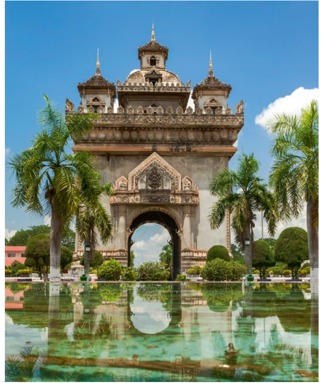
The PATUXAI in Vientiane, a monument erected to commemorate Laos's independence from France in 1949, is ironically nicknamed the Laotian Arc de Triomphe today.