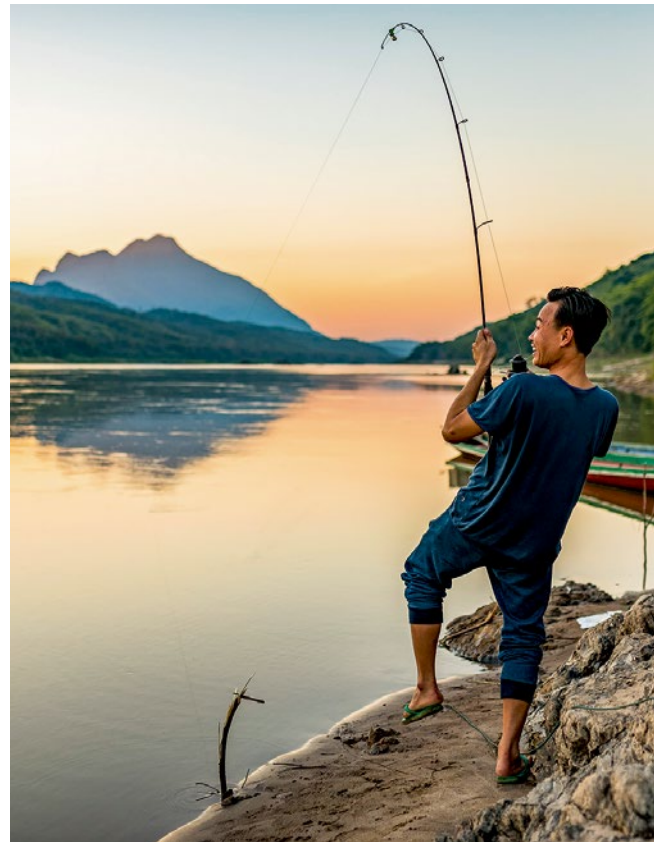
Even though Laos is a landlocked country, Laotians get most of their proteins from fish—courtesy of the MEKONG RIVER .