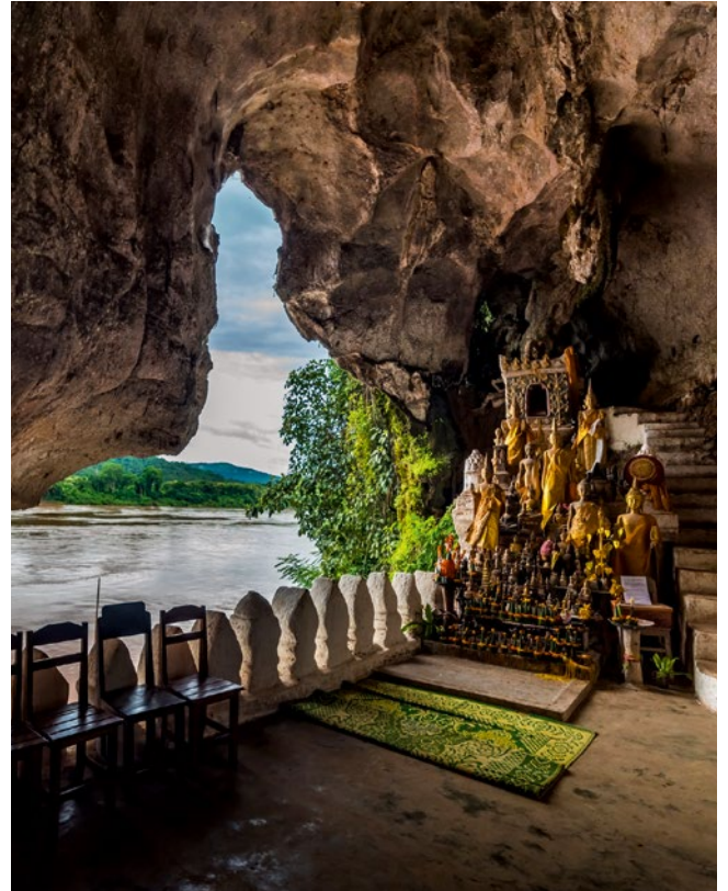
PAK OU in Laos is famous for its curious Buddha caves filled with thousands of Buddha statues in all shapes and sizes.