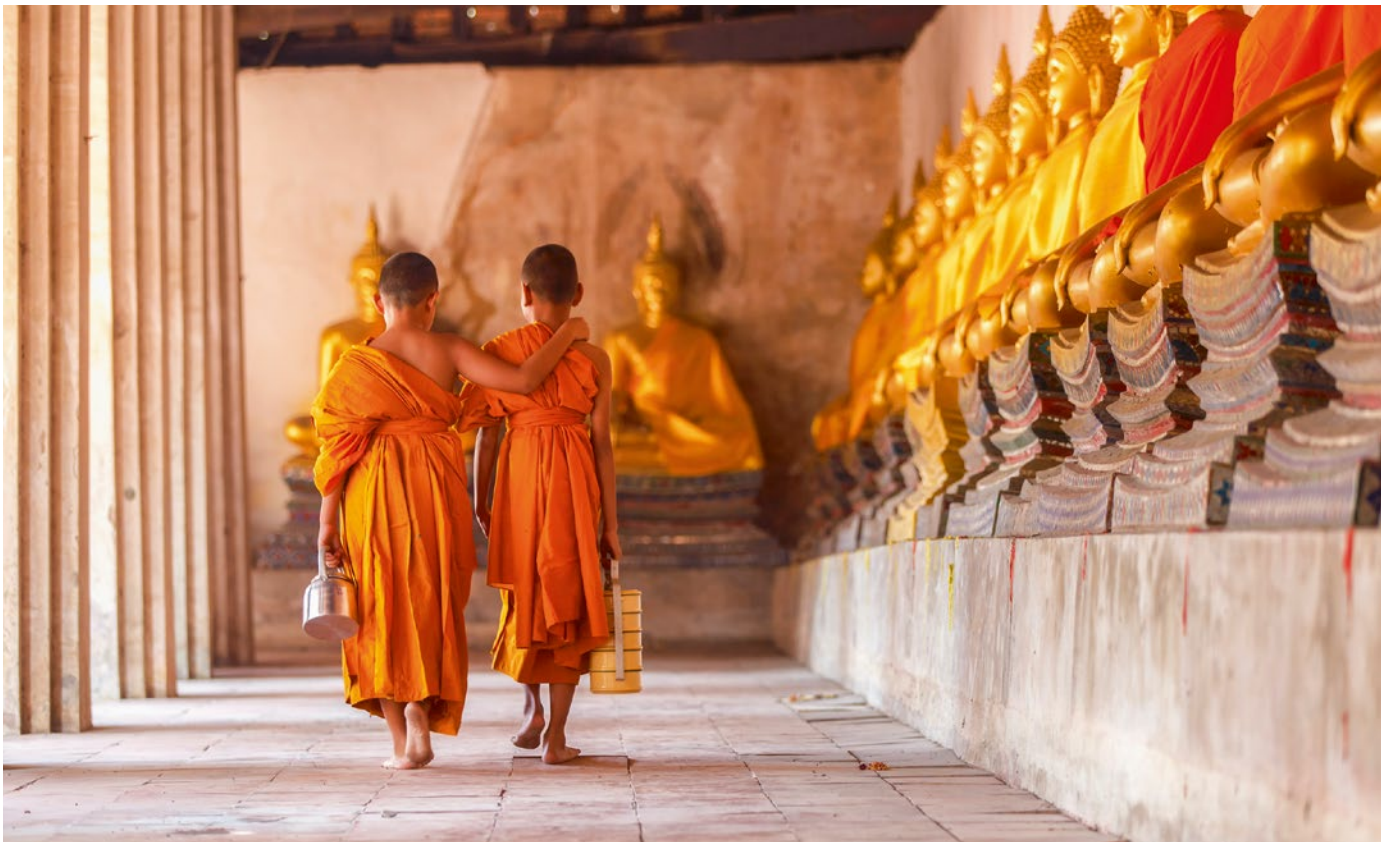
EVERY BOY IN LAOS between the age of eight and twenty is expected to serve as a novice monk to work, pray, and study at a monastery for at least three months. For some families from the more rural areas, the monasteries provide the only form of education available.