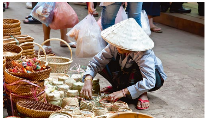
STREET MARKETS in Laos are one of the few ways for the tribes living in the mountains to exchange their handcraft for money.