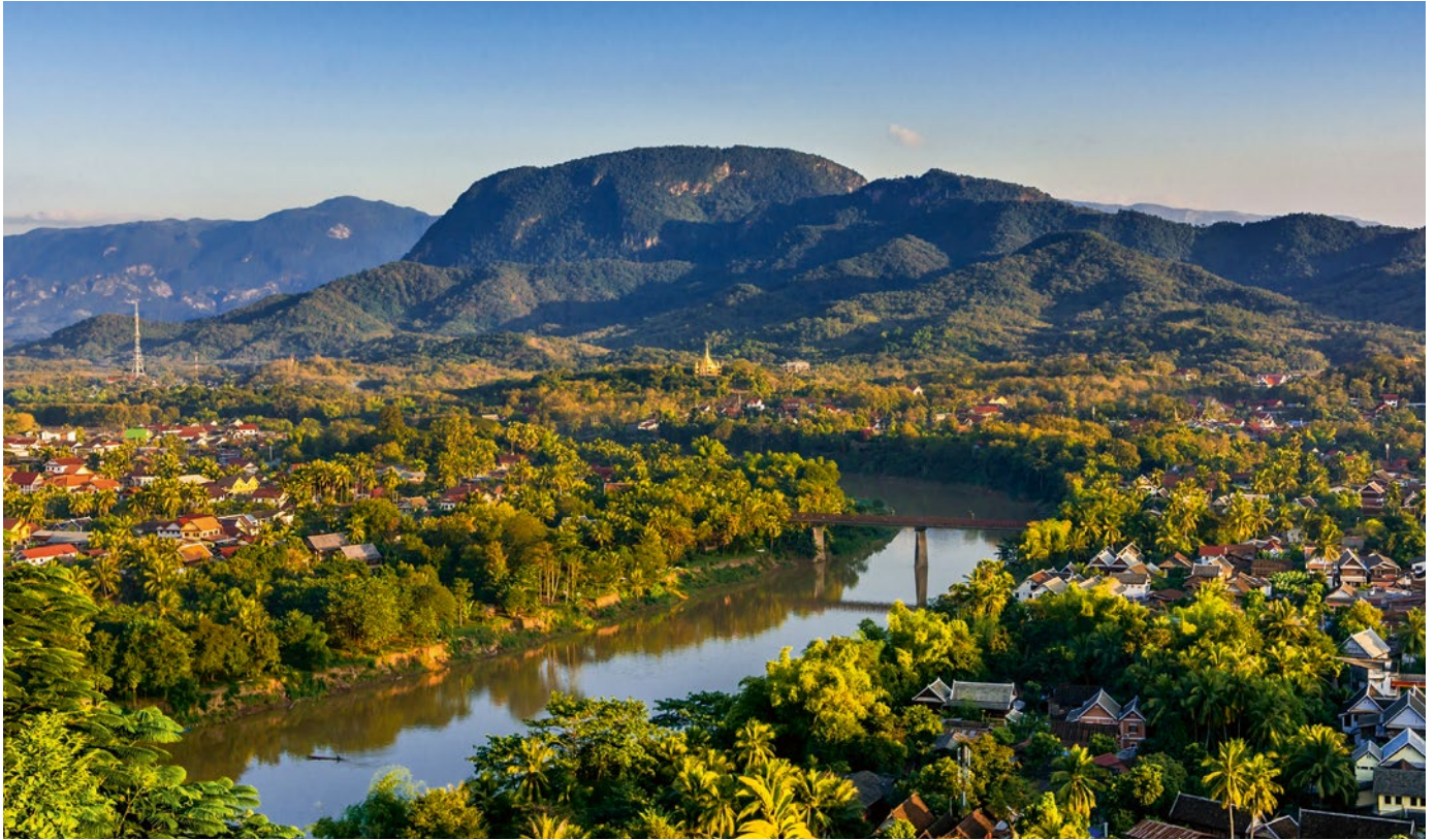
LUANG PRABANG , once the royal capital of the Kingdom of Laos that lasted from 1953 to 1975, is said to be the most beautiful city in Laos, some even say in Southeast Asia. Most parts of the little town of only 66,000 inhabitants were declared UNESCO World Heritage in 1995.