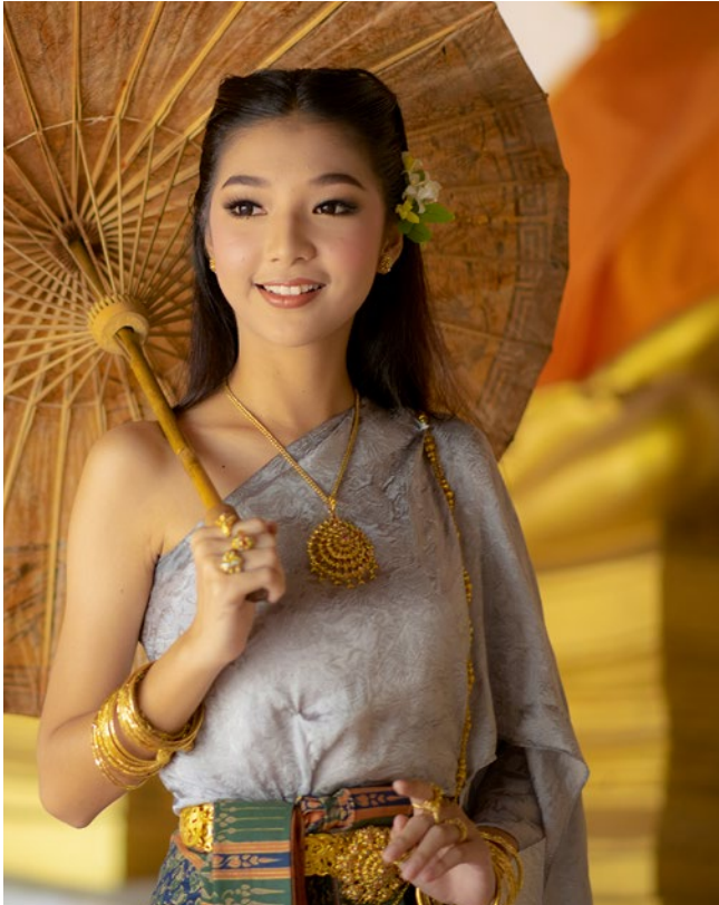
Beautiful clothes, hair, and make-up are very important in Thai culture. Looking dapper is a sign of respect for your fellow humans.