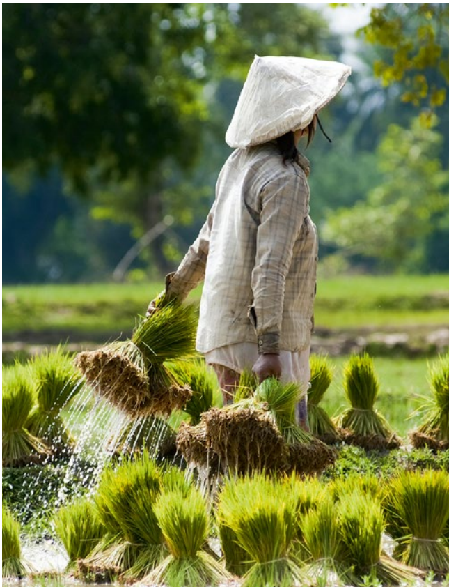
RICE makes up 60% of all crops grown in Laos. No big surprise, given that each Laotian eats 454 pounds (206 kg) of rice a year.