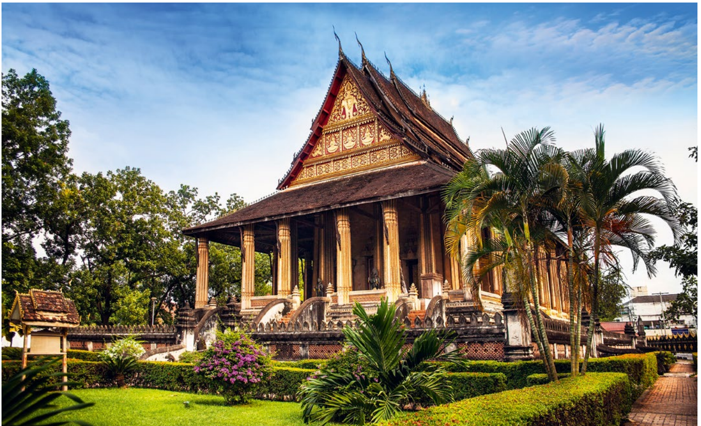
The modern-day capital of Laos, VIENTIANE is home to the Pha That Luang temple, a symbol of the nation. Legend has it that the breastbone of Buddha was kept here over 2,000 years ago.