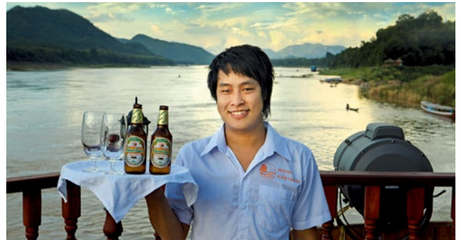
Laotian rice, French malt, German hops: BEERLAO , “Asia’s best beer” (TIME Magazine), is as cosmopolitan as a drink can get.