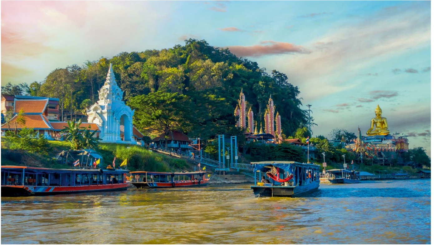
The gigantic Golden Buddha statue on top of a boat at Ban Sop Ruak marks the Tri-State area where Laos, Myanmar, and Thailand meet: the GOLDEN TRIANGLE . This area was once notorious for cross-border drug deals—today, the modern Hall of Opium Museum gives visitors a vivid impression of those wild days.