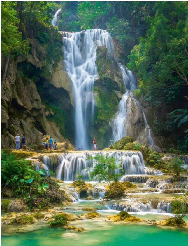
The unique multilevel KUANG SI FALLS near Luang Prabang are a favorite of travelers because of the gorgeous natural pools.