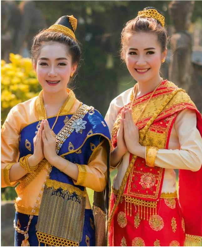
The SINH is a traditional Laotian costume still worn today. The colorful pattern of the garment is often a code revealing where the woman wearing it comes from.